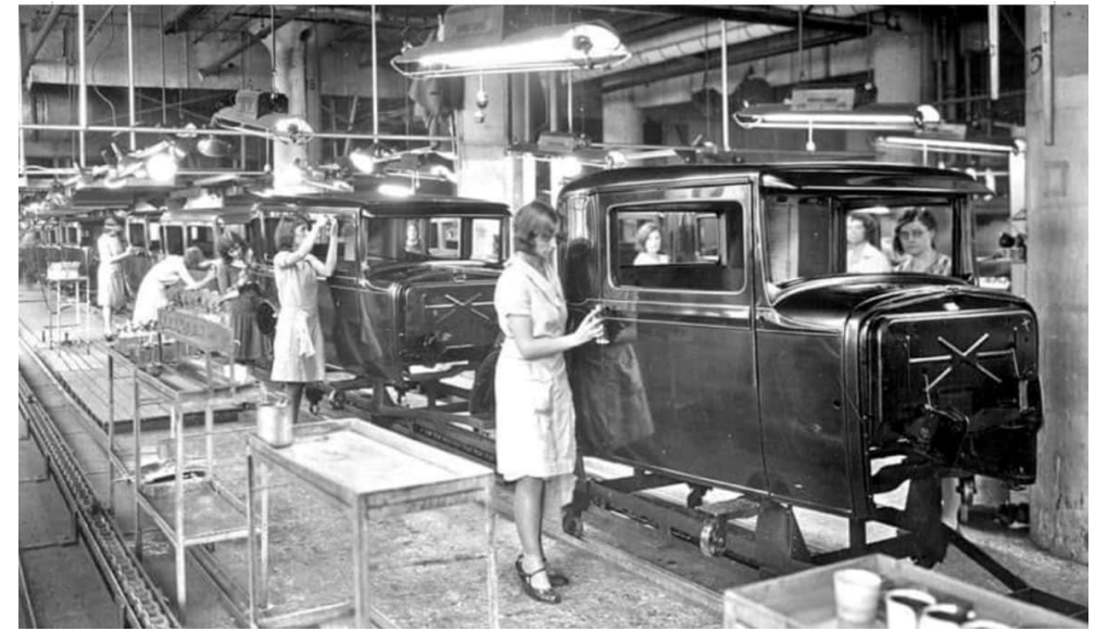
Not only are these ladies working to assemble Model A's, but they are doing so in dresses and heels!

"... Ford's creation put automobile ownership with reach of the people with average means and as a result, accelerated American's transition from a rural to urban society."